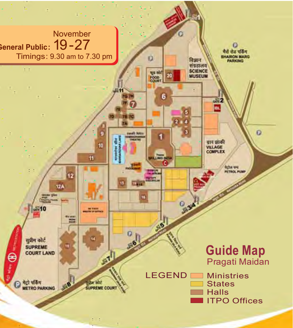
Guide Map Pragati Maidan

November General Public: 19-27 Timings: 9.30 am to 7.30 pm