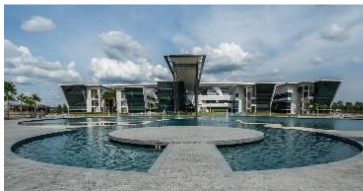
the University College of Technology, Sarawak, in Sib