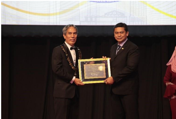
Outstanding Contribution Towards Sustainability Iskandar Puteri City Council, Johor