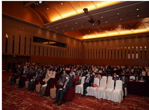
Congress Participants reached about 400