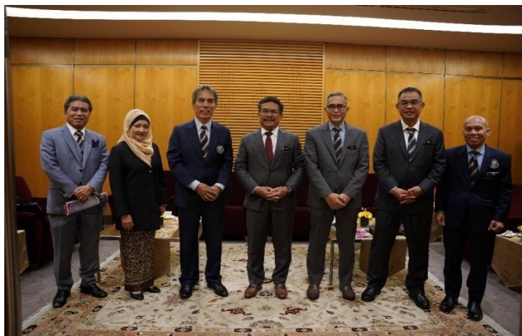
VIPs and Guest of Honour with President and Deputy President