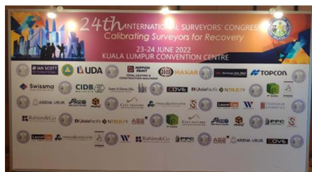
Photo wall with Sponsors List