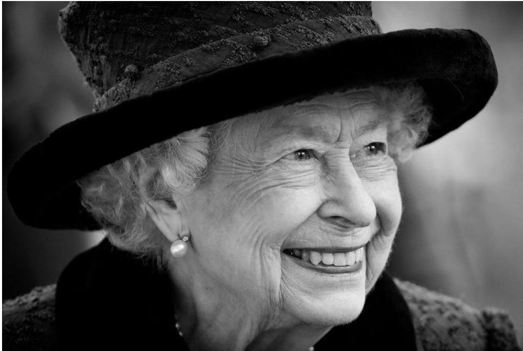
Her Majesty Queen Elizabeth II

It is with great sadness that RISM learnt of the death of Her Majesty Queen Elizabeth II. Our thoughts are with His Majesty King Charles III and the royal family at this very difficult time.