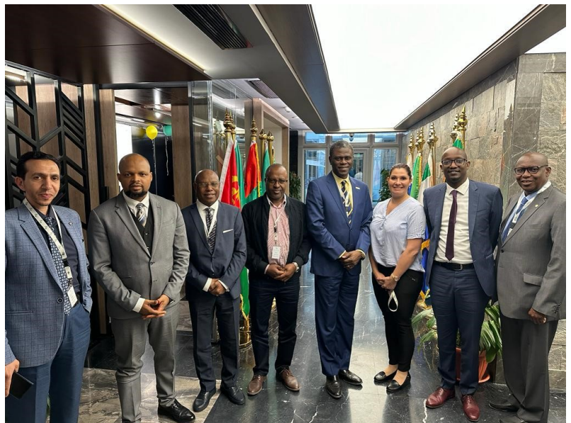
Courtesy Visit of Executive of Africa Association of Quantity Surveyors (AAQS) to Afriexim (Africa Import Export Bank) in Cairo Egypt for possible Partnering on Funding.